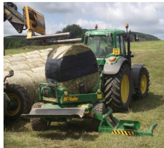
The wrapper is remote controlled so one person can load, stack and wrap from the forklift.

Then Hugh will move onto the spring barley crops and it will be all go getting the crop cut and the grain dried and then baling the straw to use for bedding and feeding the cows when they are indoors in the winter.